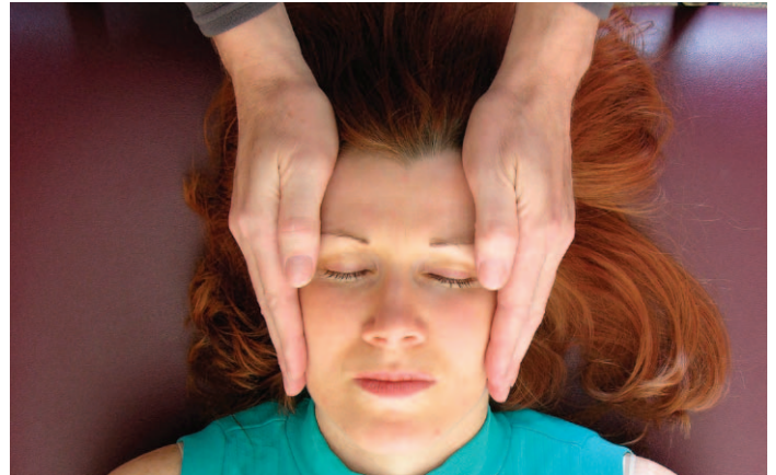
Head Position 2