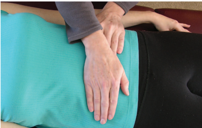
Torso Position 3