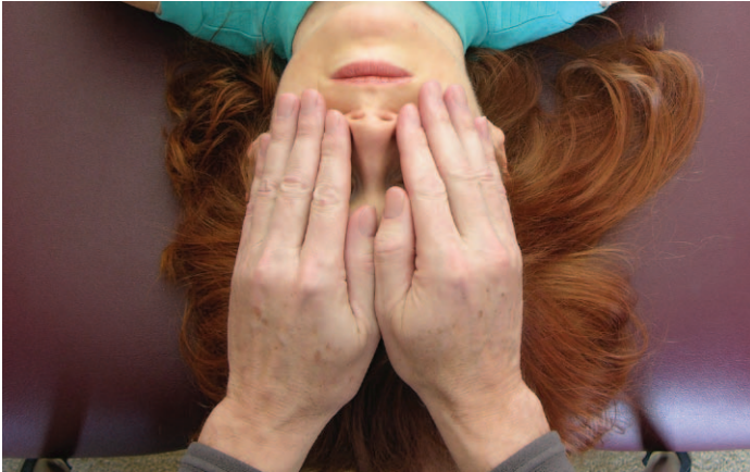
Head Position 1